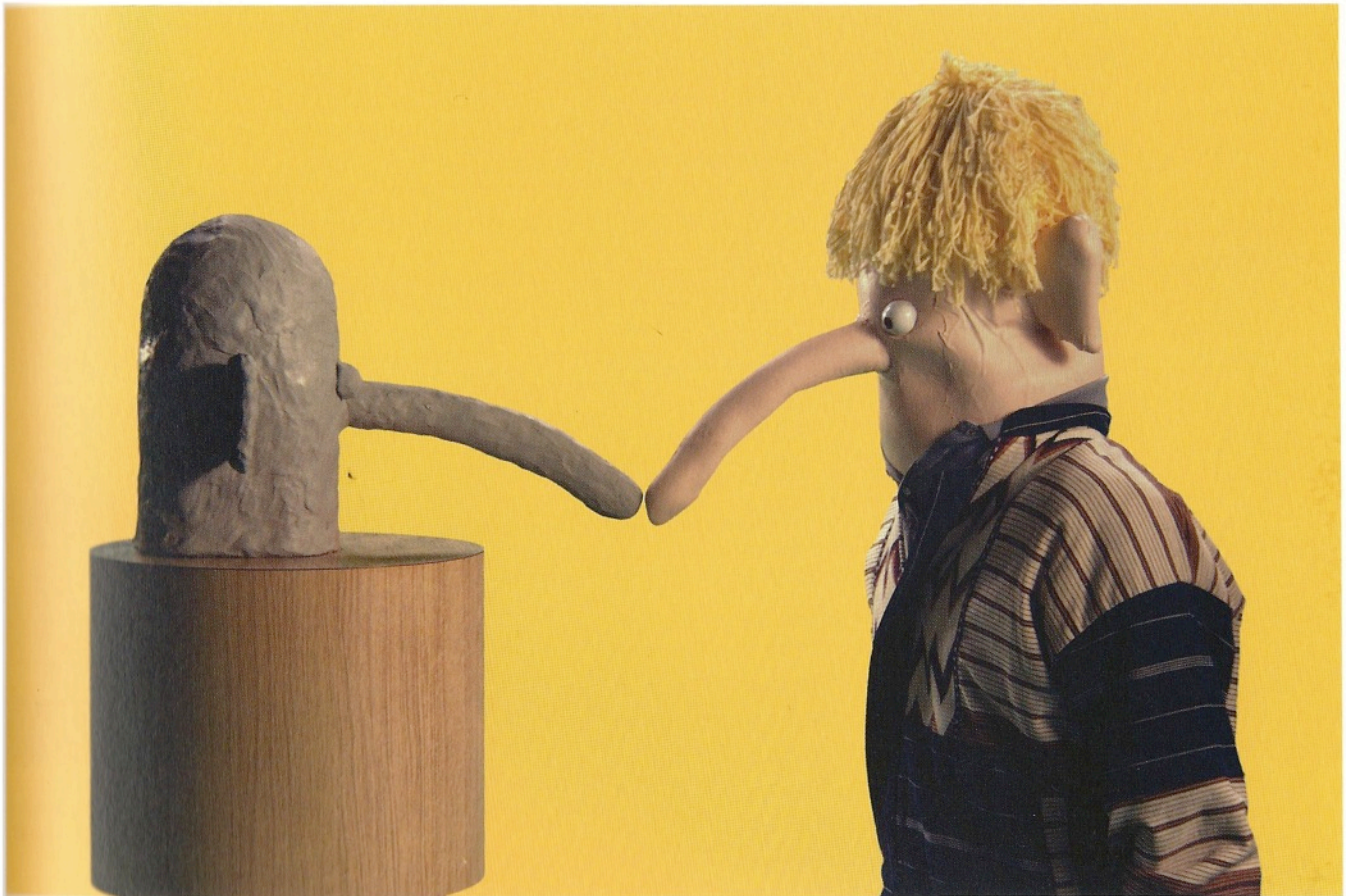
Creative Ideas for Every Season